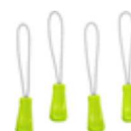
Bright and reflective zip pulls